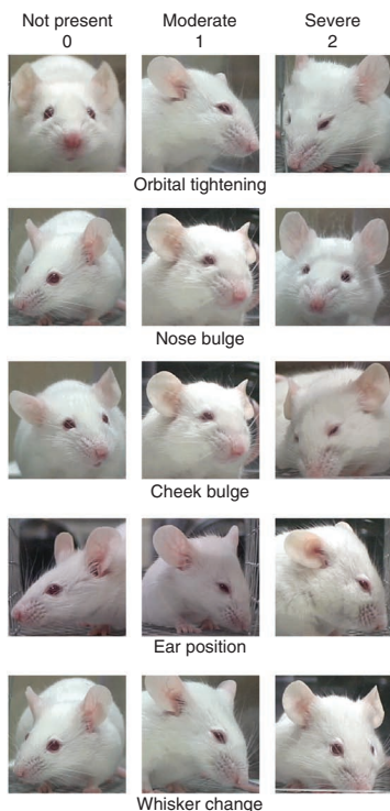
Figure 1 | In the MGS, intensity of each feature is coded on a three-point scale. For each of the five features, images of mice exhibiting behavior corresponding to the three values are shown.

improvement in accuracy, such that over 97% of pain versus no-pain calls were correct ( Supplementary Fig. 1a ).